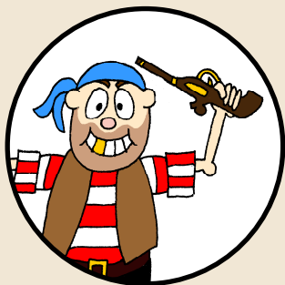
Name: Deadlights Johnson Ship: Libertalia's Loon Home port: St Kitts