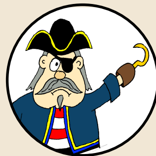
Name: Le Voleur de Bateau Ship: Vengeance Français Home port: Martinique