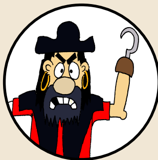
Name: Grog Blossom Law Ship: Jerking Jib Home port: Key West