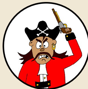
Name: Galion Concasseur Ship: Run-a-Rig Home port: Curacao